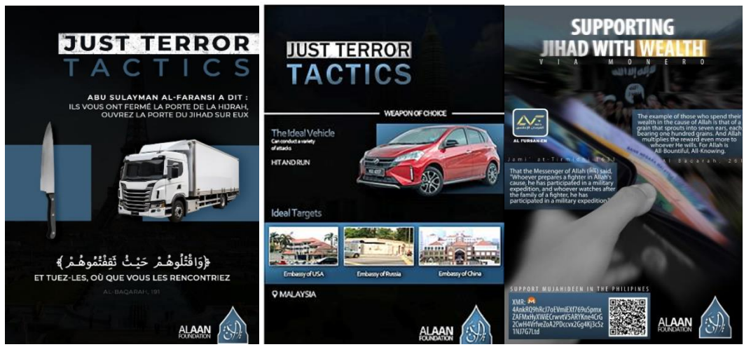
Extremist posters in French and English, and poster soliciting cryptocurrency donations (left to right)