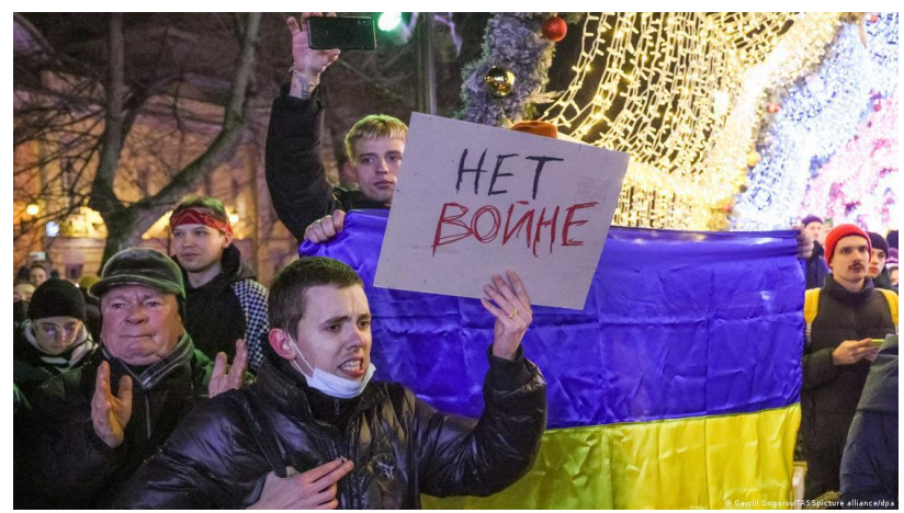
A Russian protestant brandishes an anti-war placard that translates to "No war"

3. <u>Impact of Public Perception on Cognitive Resilience</u>. Public perception of the military, including public support for the military, can affect soldiers' will to fight. According to a Norwegian study in June 2020 by the Institute of Strategy and Leadership in the University of Agder, in the case of the ongoing Russia-Ukraine war, strong public support for the Ukrainian military contributed to the surprisingly high resilience of the military, which persevered in a long-drawn battle against their stronger opponent. Conversely, the low public morale in Russia was one of the reasons for its failure to secure a swift victory over Ukraine. Positive public opinion about the military could therefore strengthen military personnel's sense of purpose and value, and consequently their cognitive resilience to fight and persevere in times of conflict.